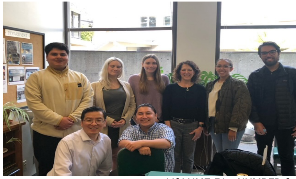
VOLUME 51 NUMBER 2