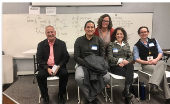
Career Panel at Fortuna High School